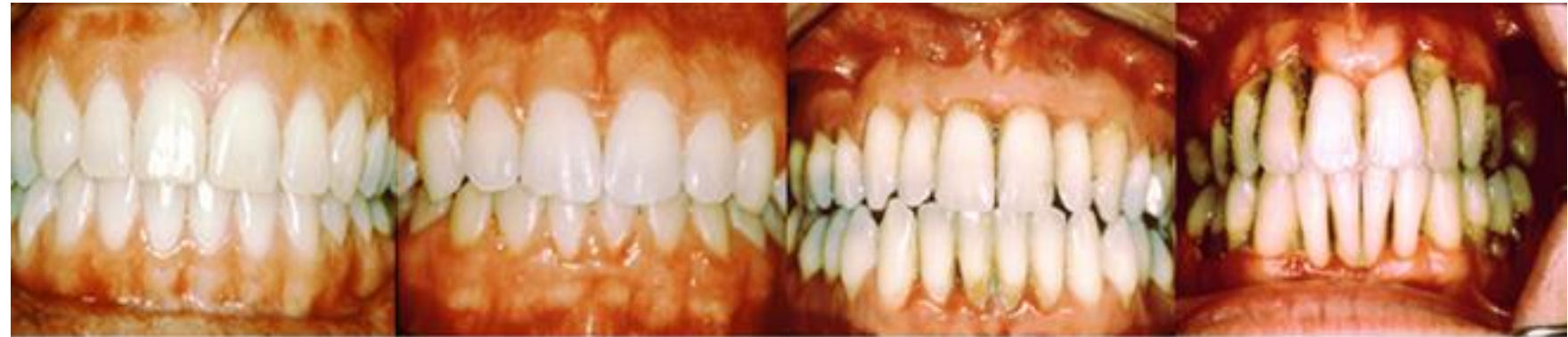
Healthy Gums → Gingivitis → Periodontitis → Advanced Periodontitis