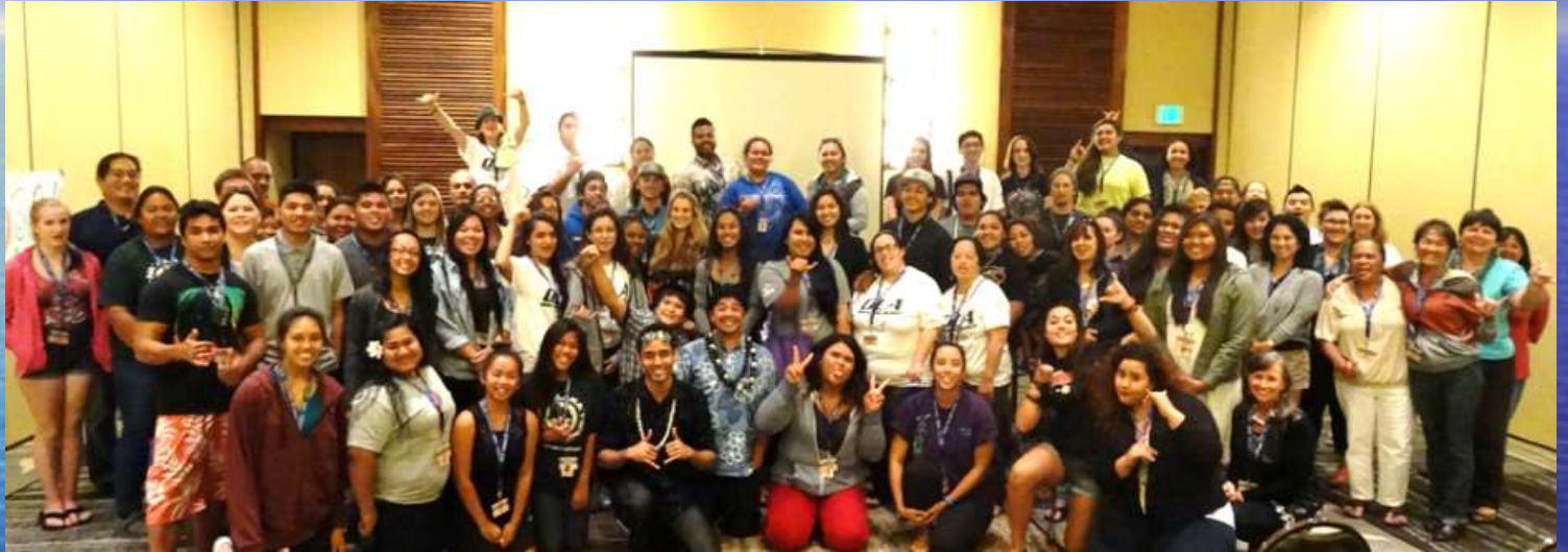
Hawaii Youth Leadership Council